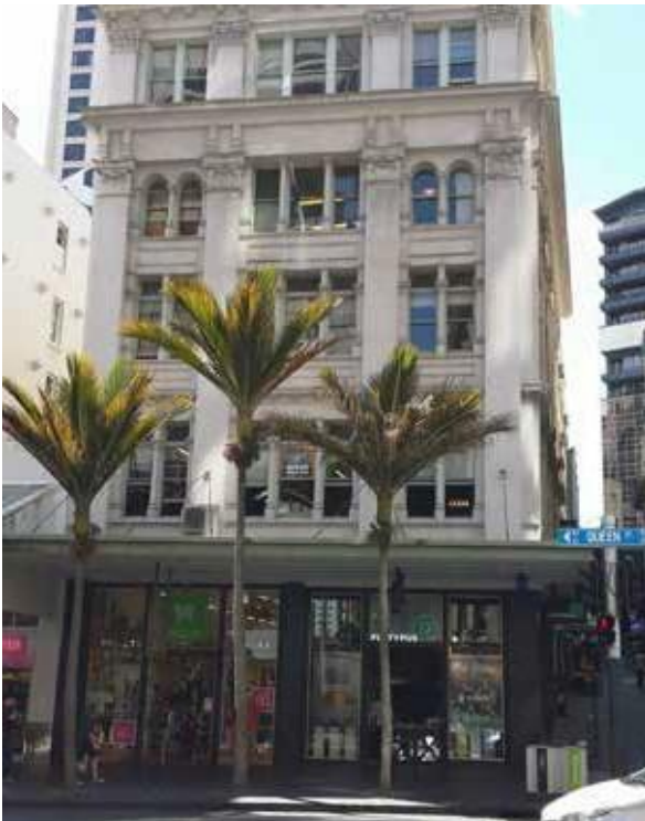
Premier Building, Queen St, Auckland

CSI is working in collaboration with other New Zealand companies on potential overseas contracts.